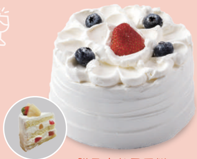
鮮忌廉什果蛋糕 Mixed Fruit Cream Cake $180 (1lb) | $280 (2lb)