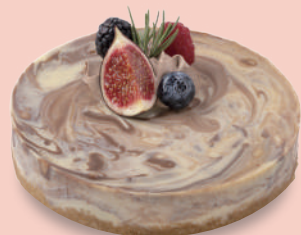
雲石芝士蛋糕 Marble Cheese Cake $200 (1lb) | $310 (2lb)