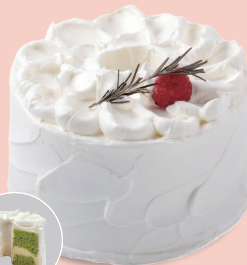
班蘭忌廉蛋糕 Pandan Cream Cake $200 (1lb) | $350 (2lb)