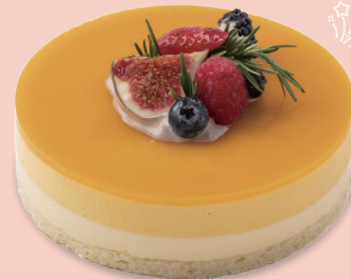
熱情果芒果慕斯蛋糕 Passion Fruit & Mango Mousse Cake $200 (1lb) | $330 (2lb)