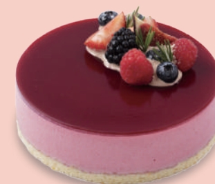
紅桑子慕斯蛋糕 Raspberry Mousse Cake $200 (1lb) | $330 (2lb)