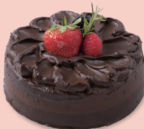
特濃朱古力蛋糕 Chocolate Fudge Cake $200 (1lb) | $330 (2lb)