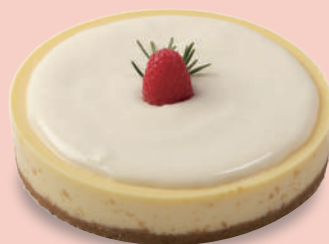
紐約芝士蛋糕 New York Cheese Cake $200 (1lb) | $310 (2lb)