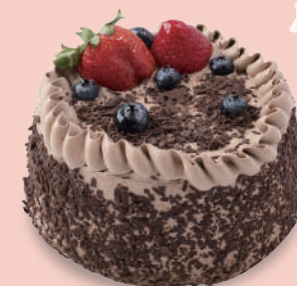
黑森林蛋糕 Black Forest Cake $180 (1lb) | $280 (2lb)