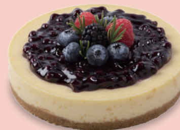
藍莓芝士蛋糕 Blueberry Cheese Cake $200 (1lb) | $310 (2lb)